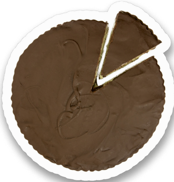
jumbo peppermint patty