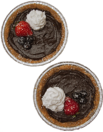
Mini Chocolate Pies { $10 }